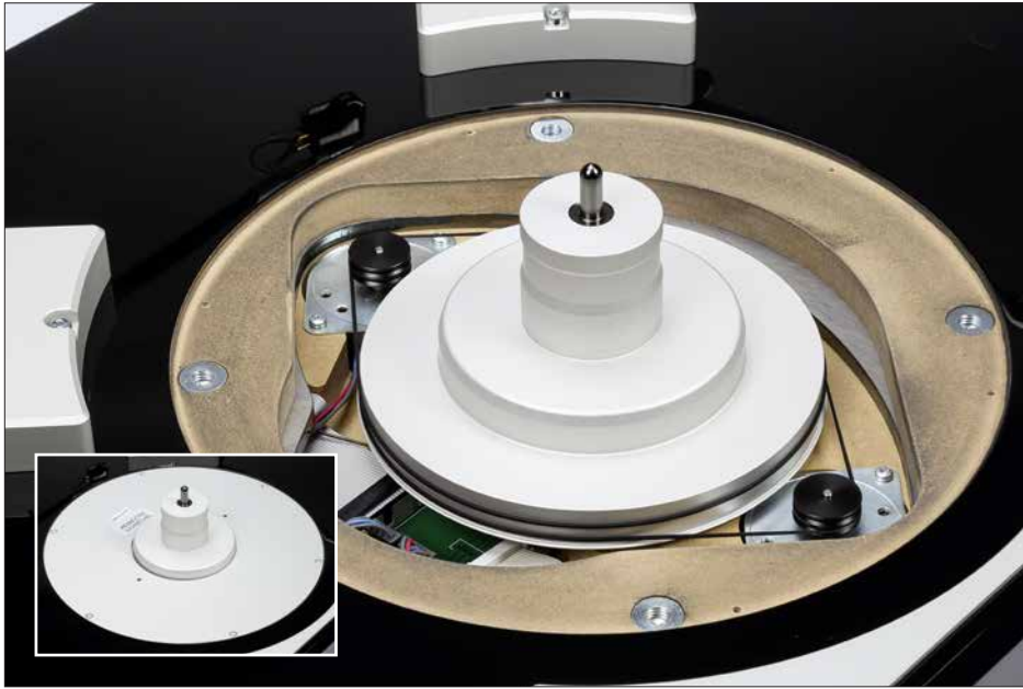
After removing an aluminum cover (left), the view onto the solid inner plate and the two opposing motors, which wrap around it with short belts, becomes clear.