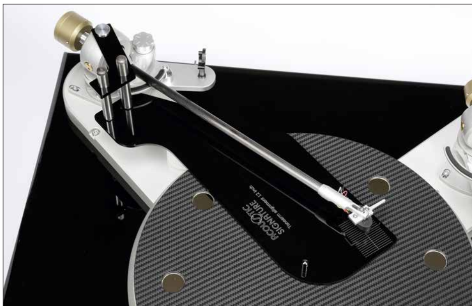
Each tonearm comes with a template that has a fixed reference point on the platter axis. It defines the distance between it and the arm pivot point as well as the overhang and angle of the pickup.

Before we could really get started, the tonearms of course had to be mounted. They each have a double-layer carbon rod, with the two layers being firmly connected by three thin bars of the same material. Thanks to precise templates, all the necessary tools and first-class, illustrated instructions in the accompanying accessories, this is no problem for any reasonably skilled analog fan after a short introduction, but rather a pleasure. For everyone else, please leave