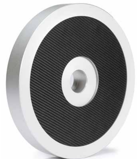
A damping mat made of bonded leather fiber is applied to the underside of the plater.