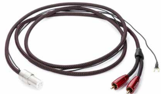
Each tonearm comes with a 1.5 meter long AudioQuest „Golden Gate“ phono cable.

Mains Phase: The phase side of the mains cable should be at the bottom. Otherwise, the Verona Neo will not show its full potential in terms of spatiality and timing.