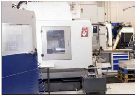
Several state-of-the-art CNC machines are used in production at the factory in Süßen.