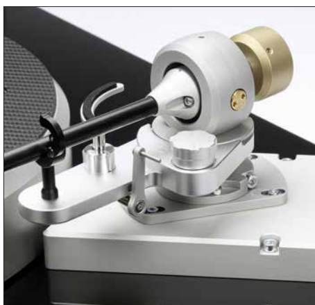
The neatly manufactured tonearms have smooth-running precision ball bearings from SKF.

In the end, this is what Acoustic Signature made the Verona Neo for. It is also available with an unmilled base, but then a later replacement would cost around 550 euros. If you take a pre-drilled one and start with one arm, you can upgrade at any time. Because in the end this means twice the listening pleasure. ■