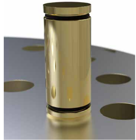
The „silencers“ pressed into the platter only make contact with it via their rubber rings.