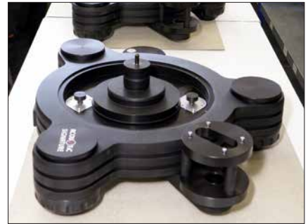
The production of almost all parts and the assembly of the turntables takes place on site.

Two AC motors keep the almost eleven-kilogram platter in motion. To prevent one-sided pull on the extremely low-friction, hard and durable „DTD“ bearing with diamond-coated spindle – a specialty of the manufacturer –, they are positioned opposite each other and drive the already massive sub-platter by means of short round belts.